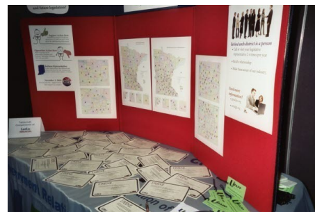
UMAPP Selling Solutions Showcase: Government Relations Booth